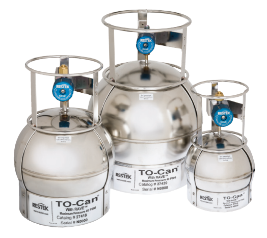
Canisters are the gold standard for ambient VOC monitoring.

Do not exceed canister maximum pressure of 40 psig (2.75 bar).